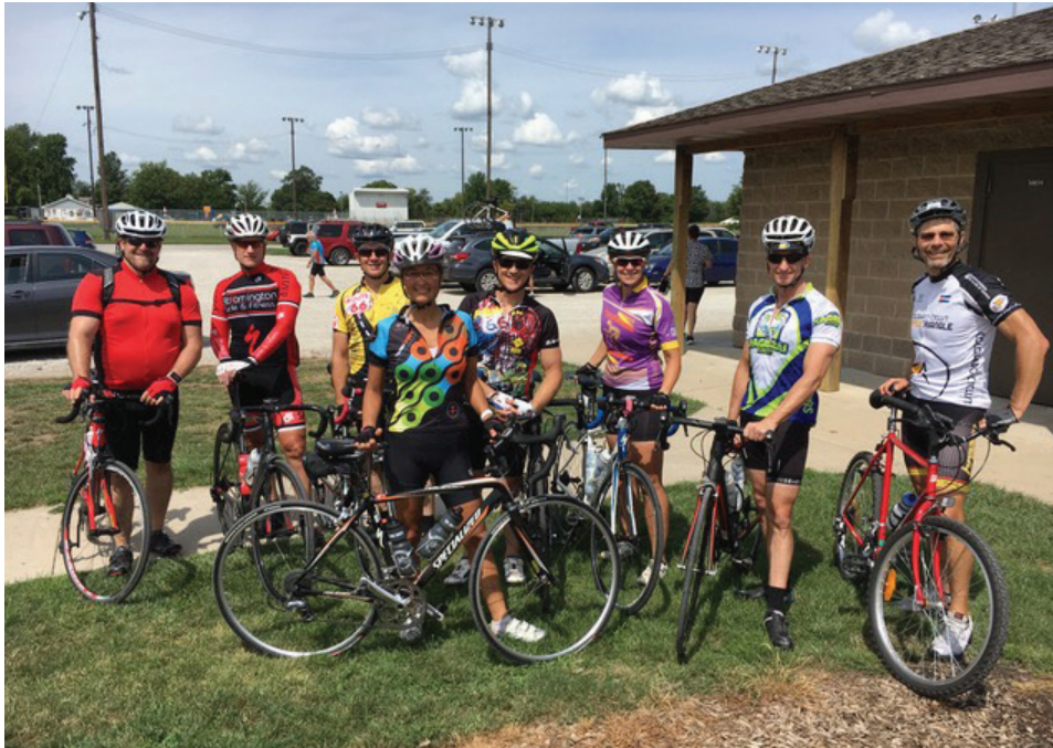
Riders at ParkLands Bike Event