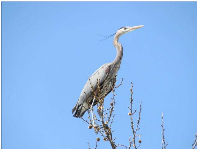
A Great Blue has just exited its nest. Note the breeding plumage.